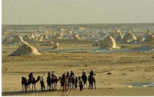
Members of the group trek on camels in the Eastern Sahara desert of Egypt. Photo: AP / Jens Palme, Breaking the Ice

© 1995 - 2006 The Jerusalem Post. All rights reserved.