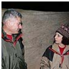
Two Israelis turned away

The group, comprising 10 men and women from Israel, the Palestinian Authority, Iraq, Iran, Afghanistan, Ukraine, and the United States, embarked on the journey from Jerusalem in late February, and hoped to arrive in Tripoli 5,500 km later after passing through Ramallah, Jericho, Beit Shean, Amman, and the Suez Canal.